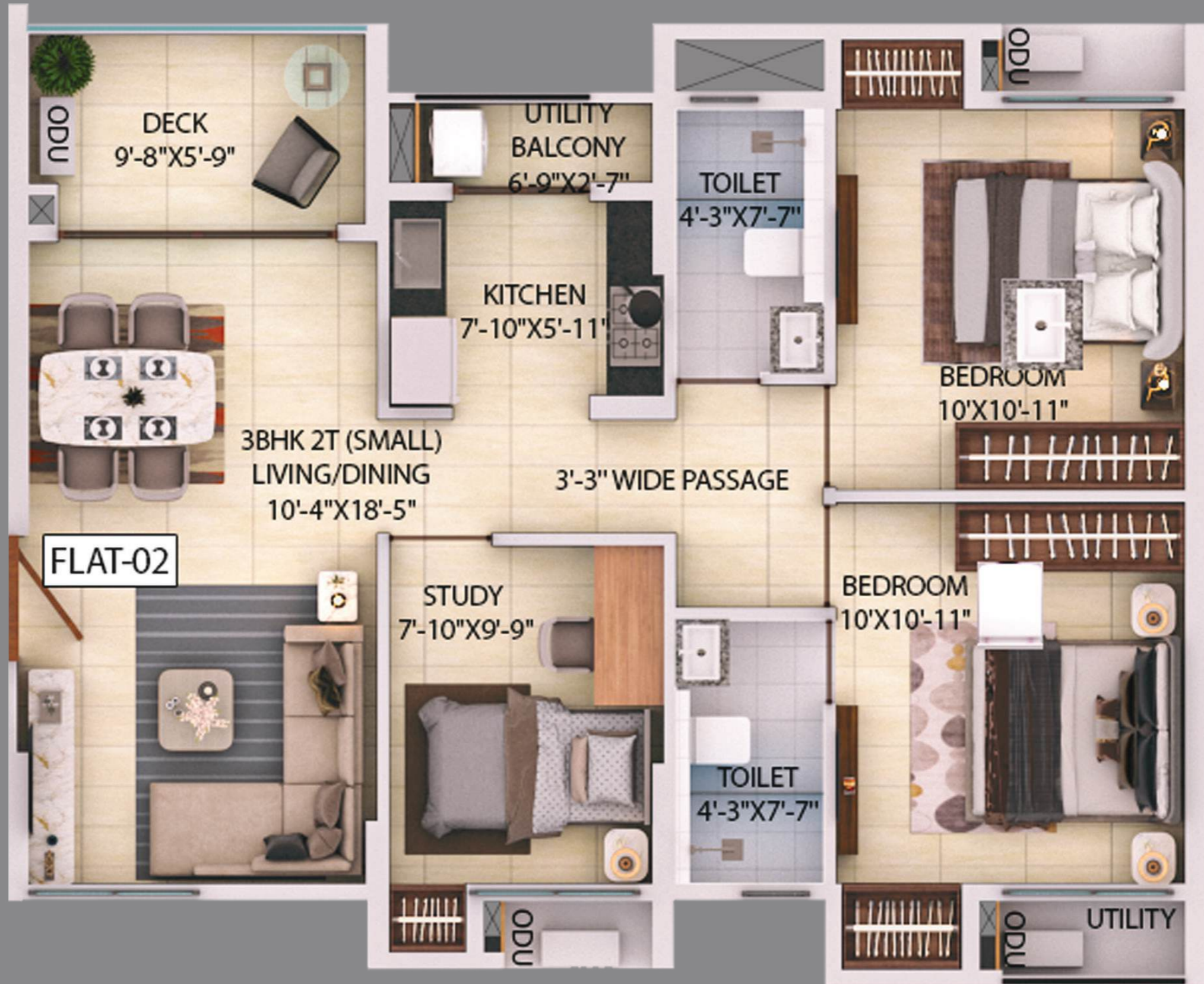
TOWER C - FLAT 2