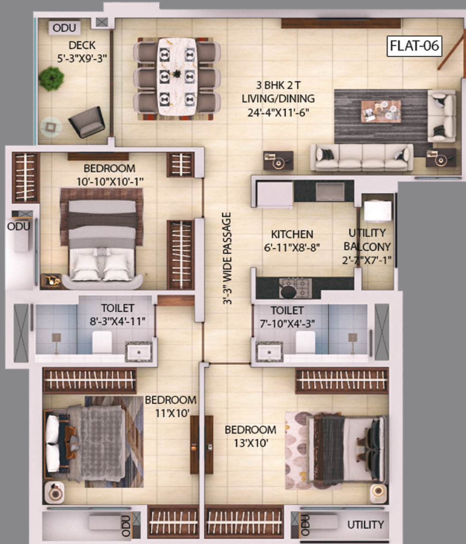
TOWER C - FLAT 6