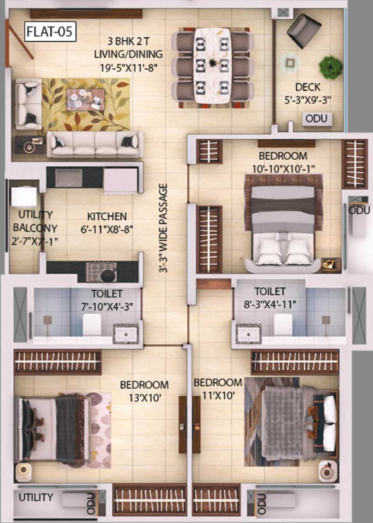
TOWER C - FLAT 5