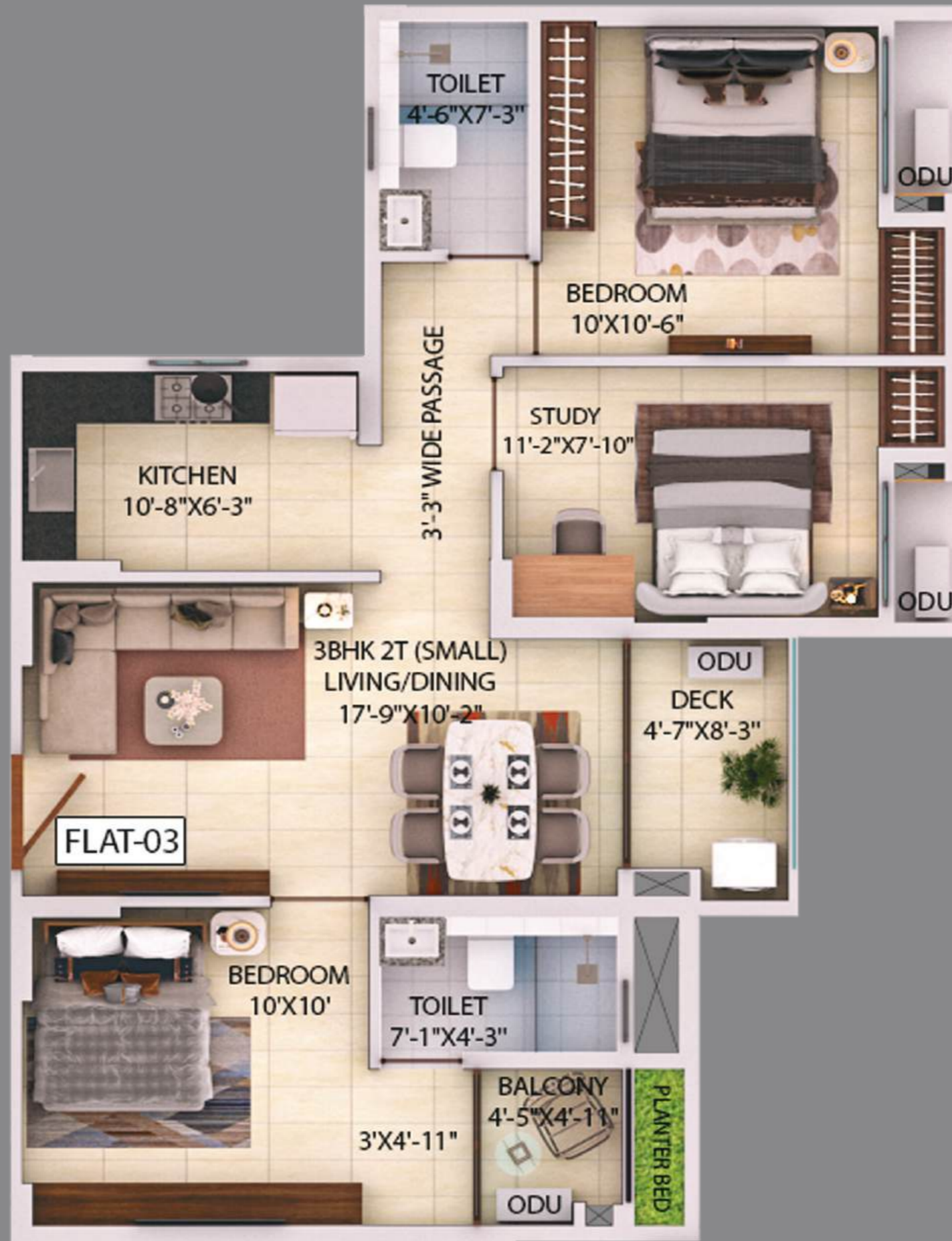
TOWER C - FLAT 3