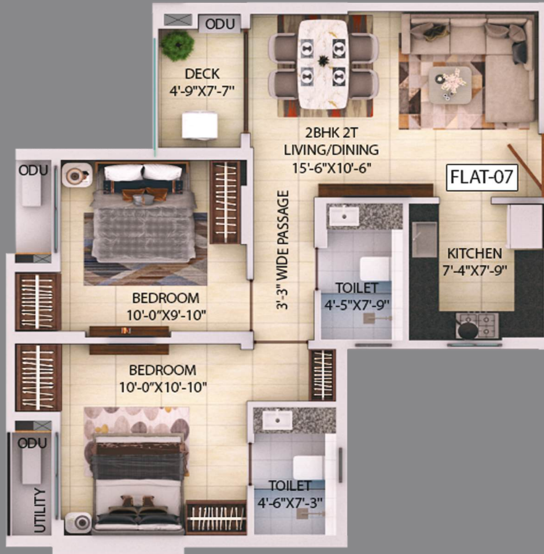
TOWER C - FLAT 7