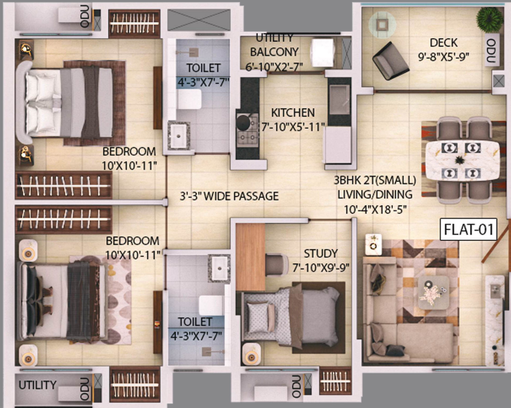
TOWER C - FLAT 1