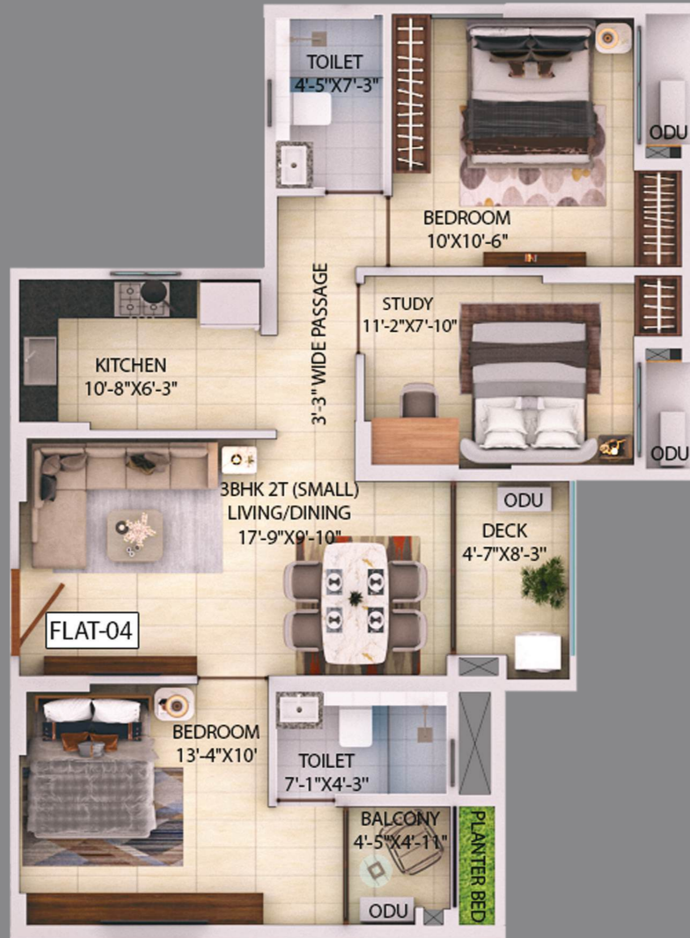
TOWER C - FLAT 4