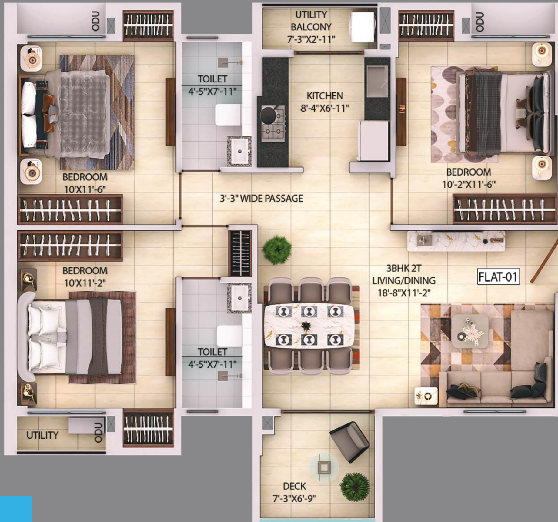
TOWER B - FLAT 1