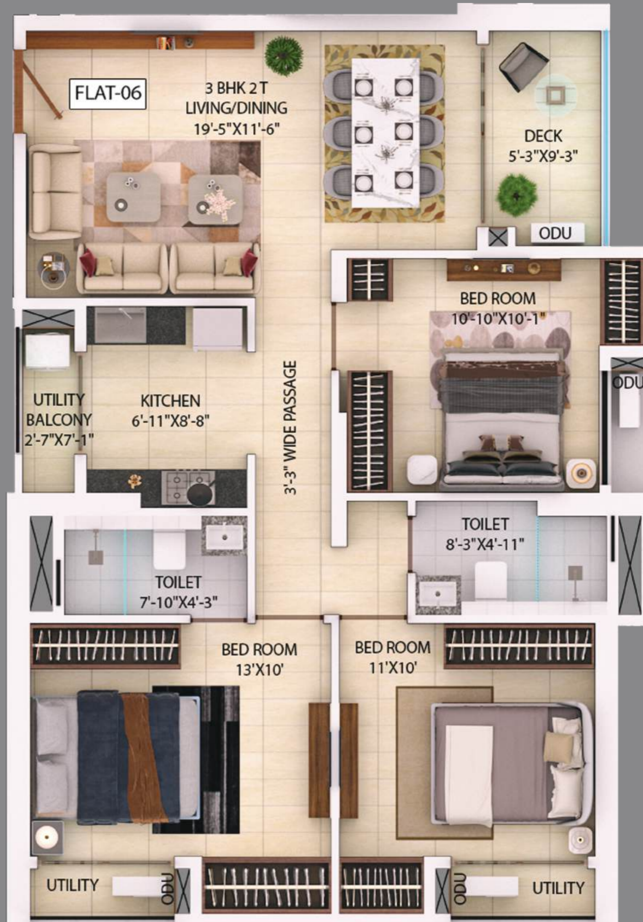
TOWER A - FLAT 6