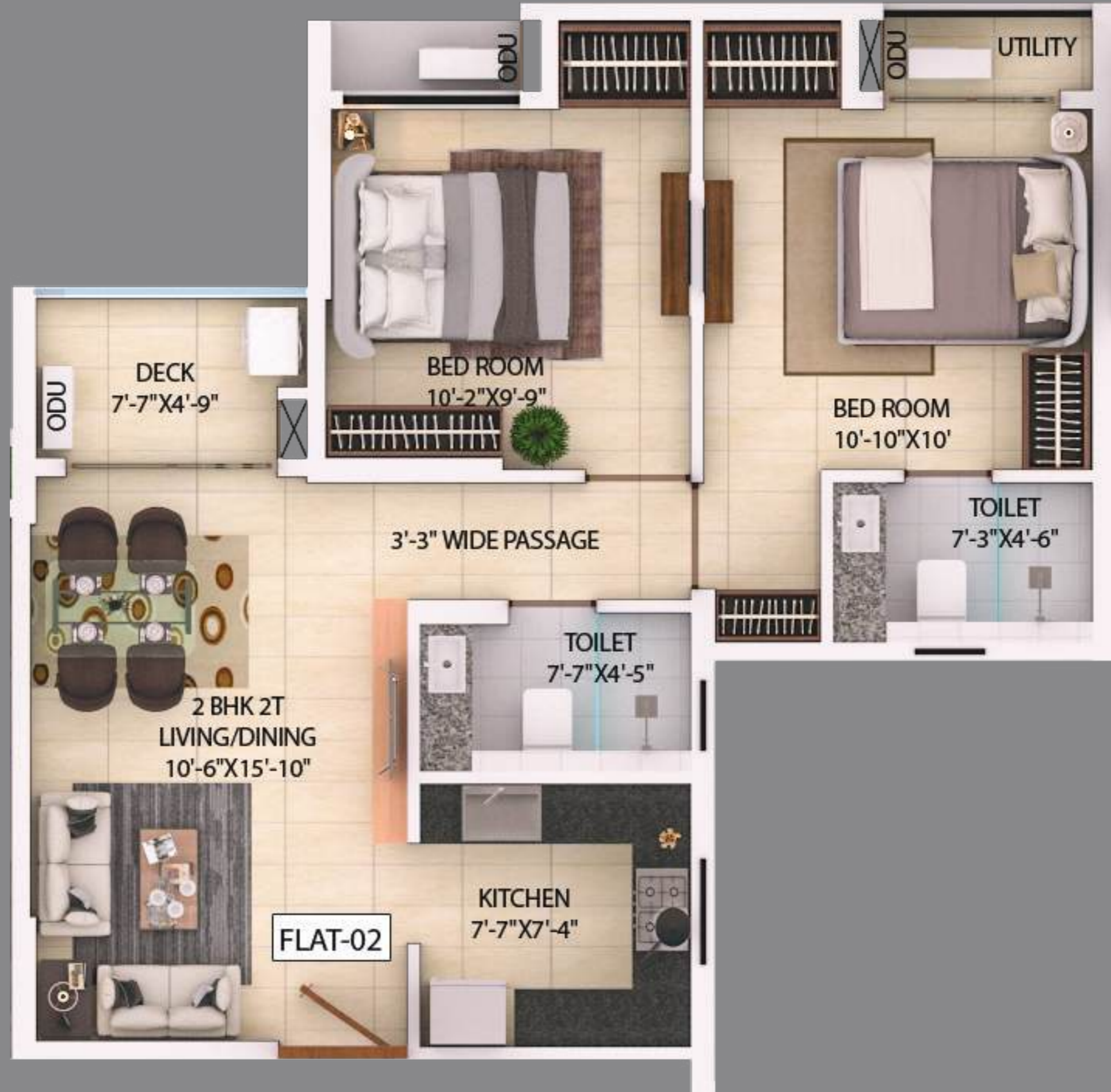
TOWER A - FLAT 2