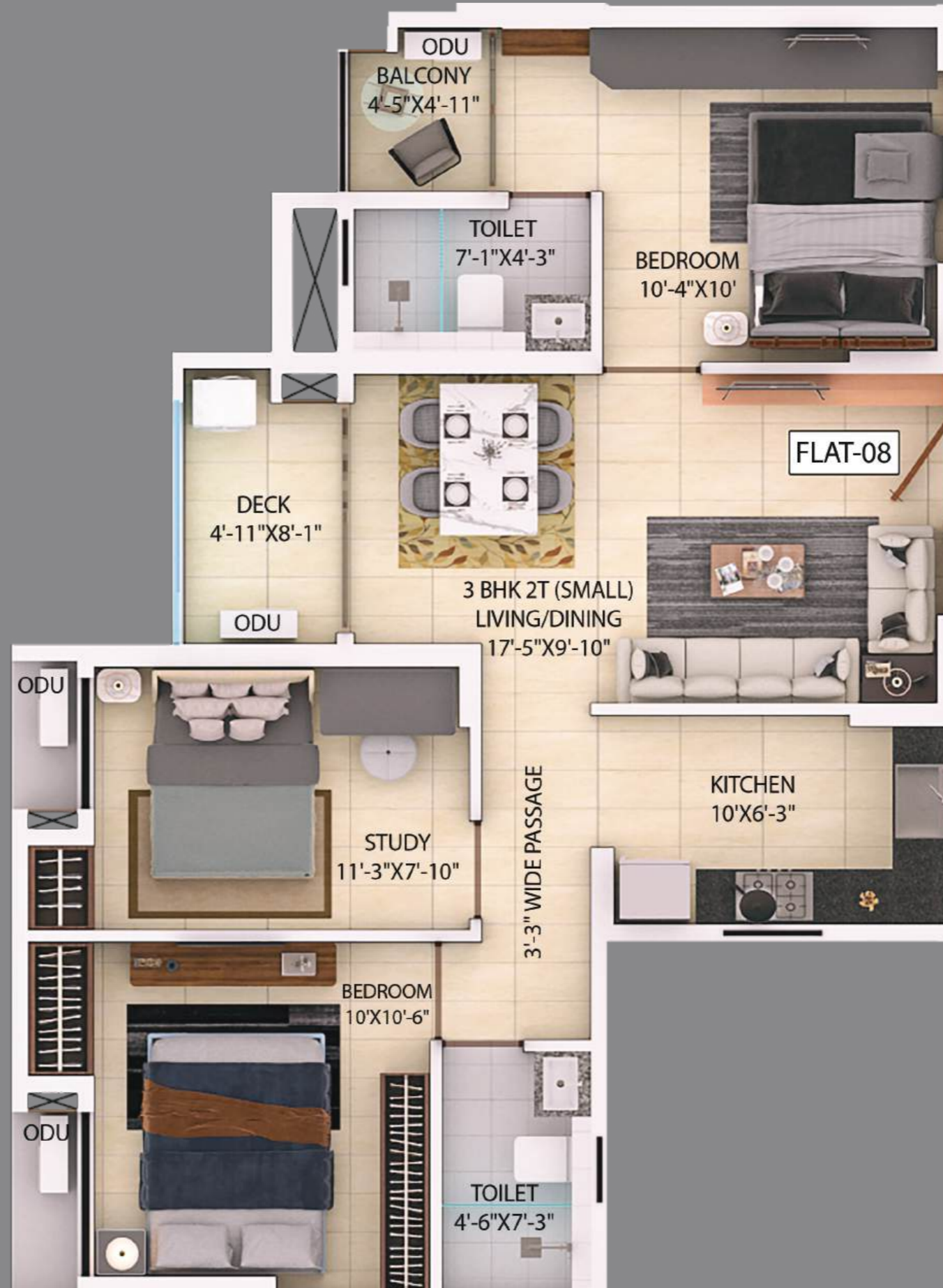
TOWER A - FLAT 8