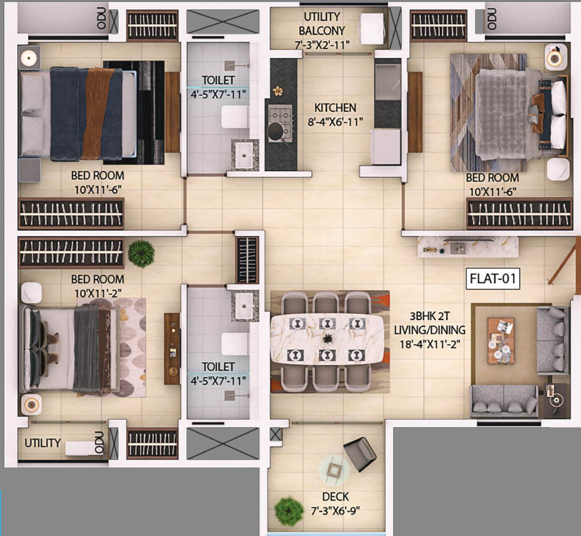
TOWER A - FLAT 1