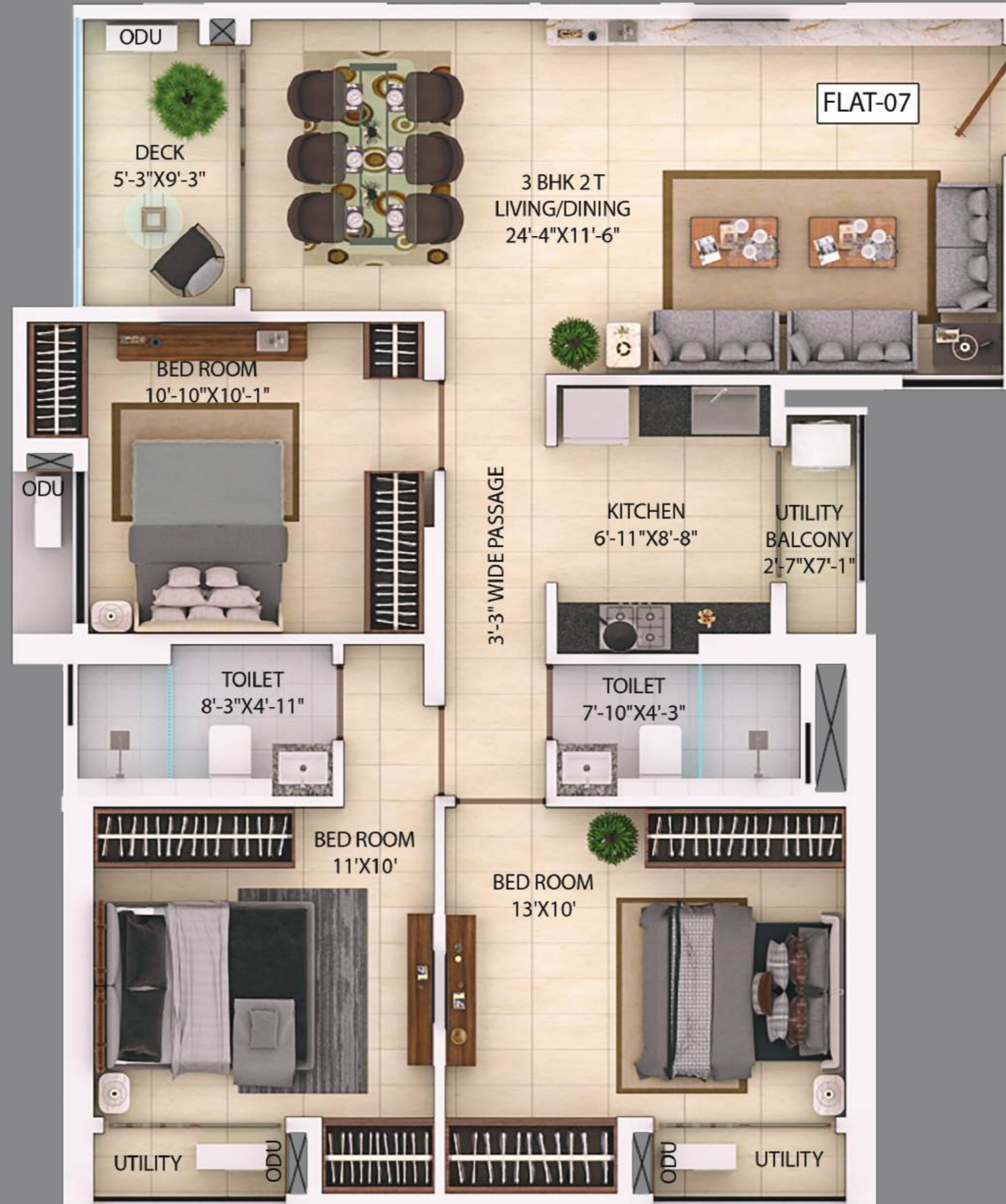
TOWER A - FLAT 7