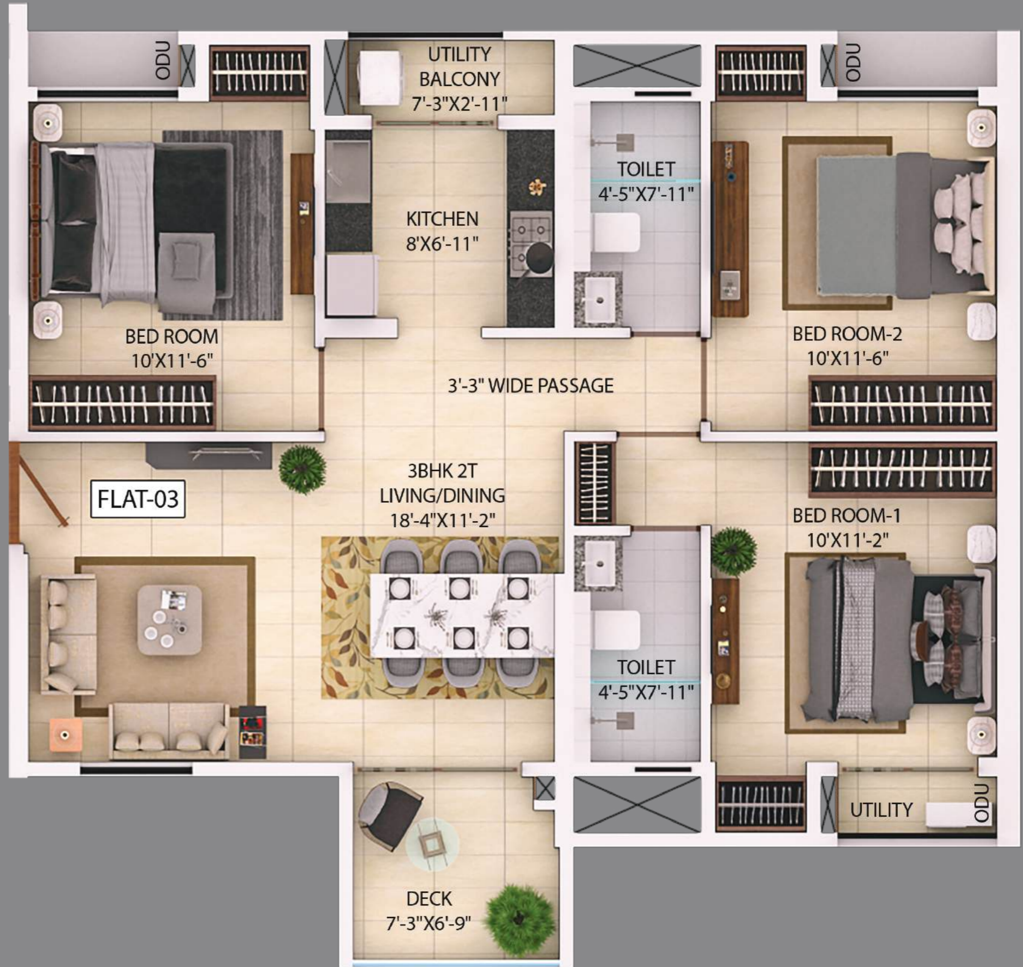
TOWER A - FLAT 3